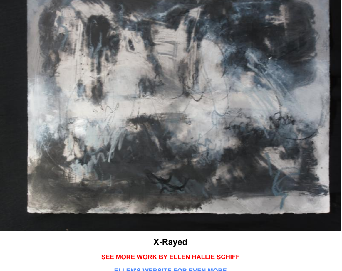
ELLEN'S WEBSITE FOR EVEN MORE WATCH ELLEN'S VIDEO AND SEE HOW SHE DOES IT!